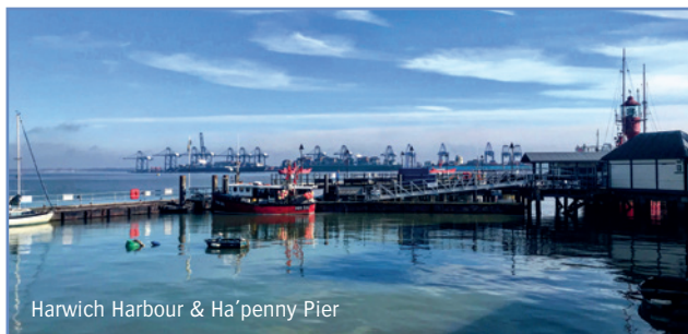
Harwich Harbour & Ha'penny Pier

Tel: 01255 553610 www.harwich-society.co.uk